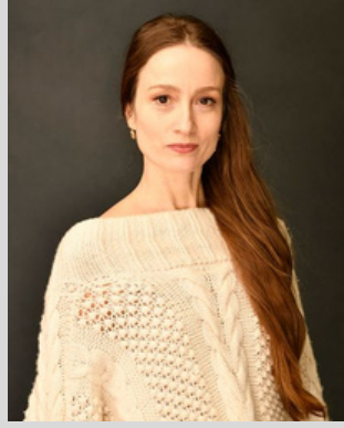
Julie Kent Artistic Director