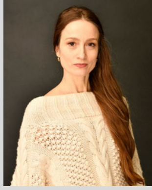
Julie Kent Artistic Director